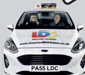
Put it into practice