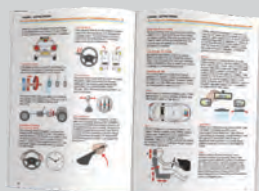
Do the quiz