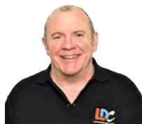
PADDY Joined 2022

To maintain our high standards and to prioritise our own students LDC is only prepared to offer the opportunity to work on a Trainee Licence to those who choose to train with us from the start.